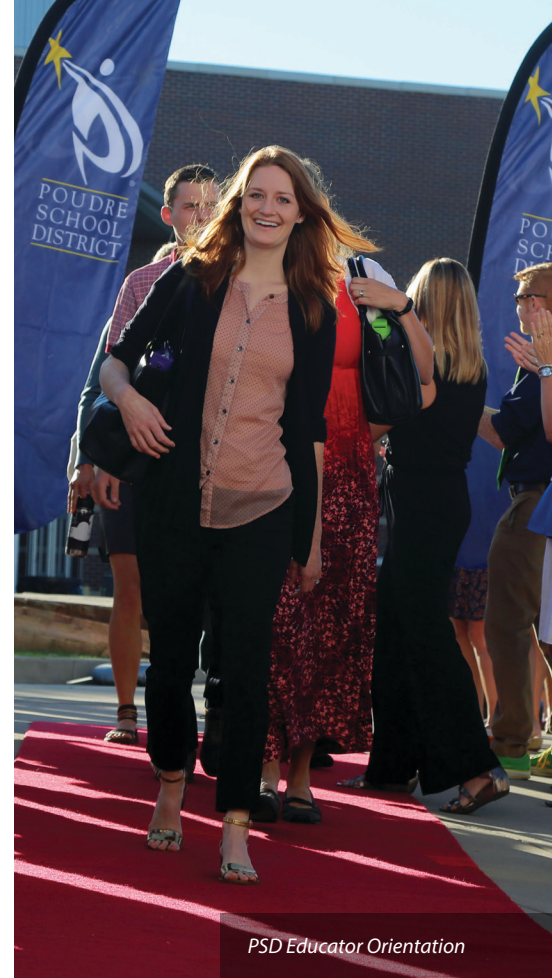
PSD Educator Orientation

The second and third days of orientation allow for grade level and role-specific cohorts to dig deeper into the Framework as well as dedicated time for school-based welcomes and orientation.